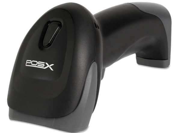
ION 2D Bluetooth